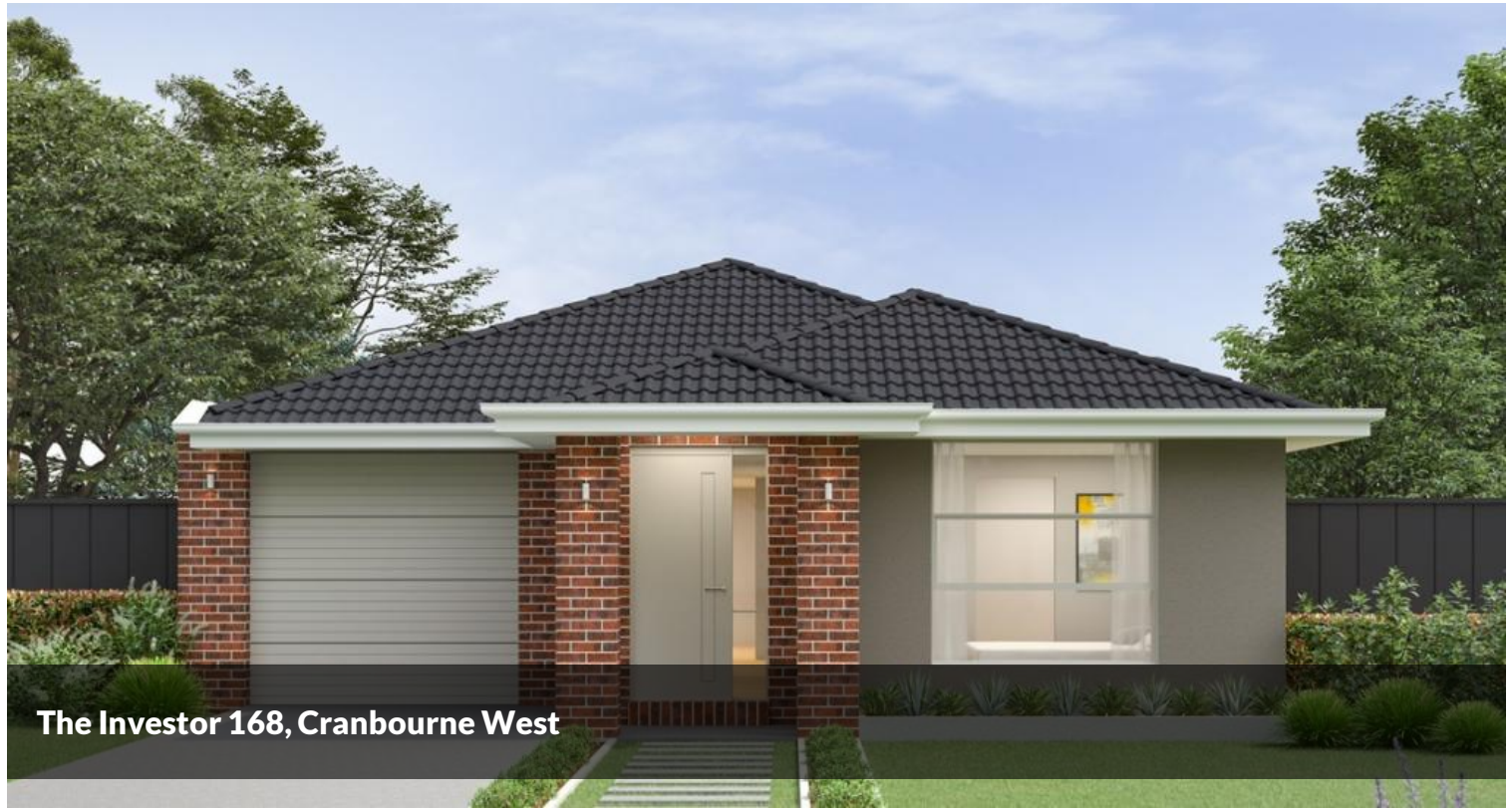
The Investor 168, Cranbourne West