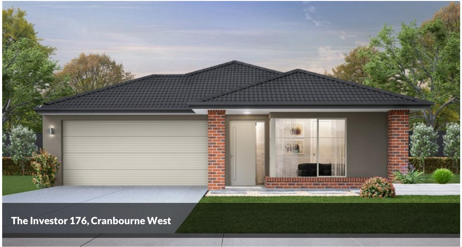
The Investor 176, Cranbourne West