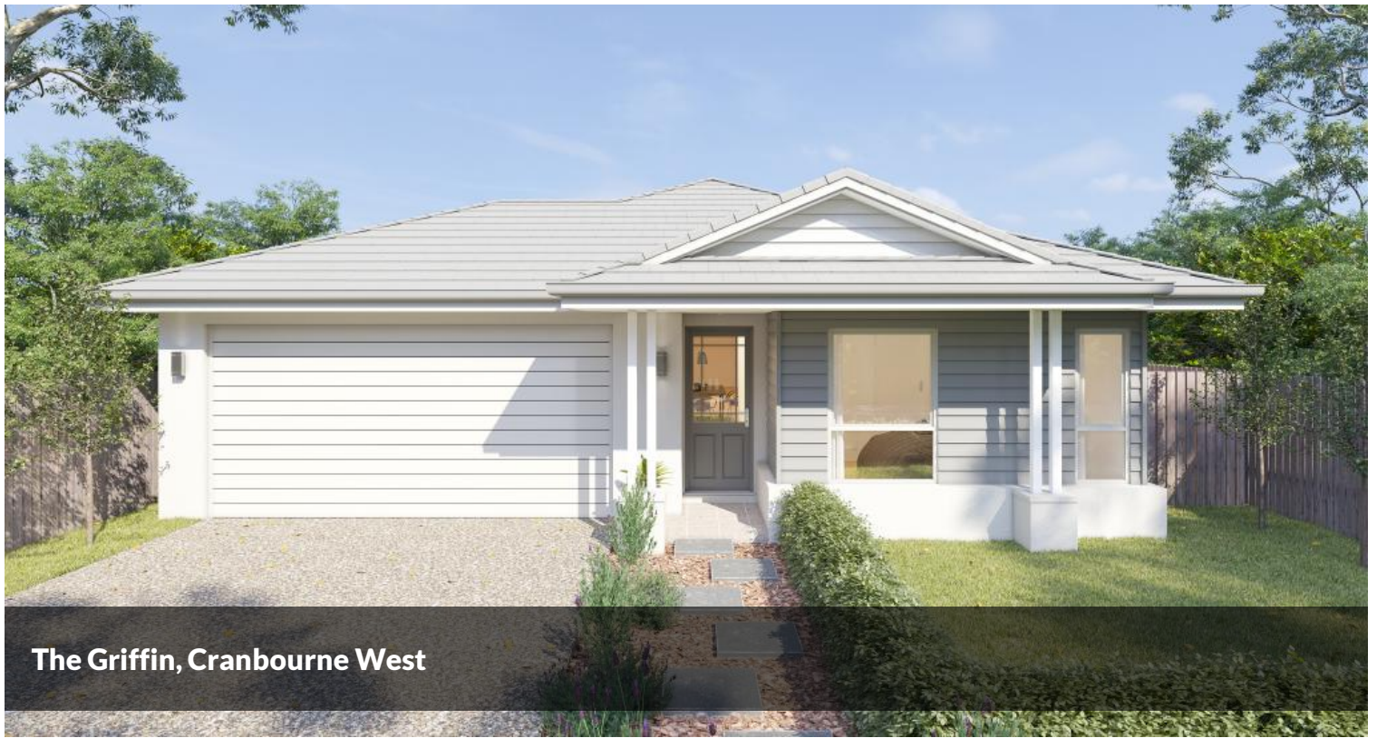
The Griffin, Cranbourne West