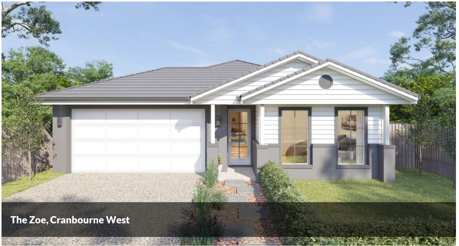
The Zoe, Cranbourne West