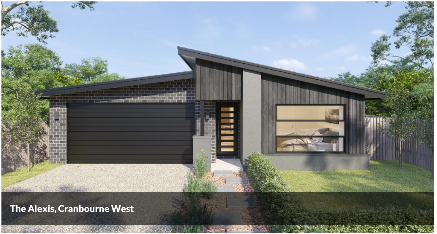
The Alexis, Cranbourne West