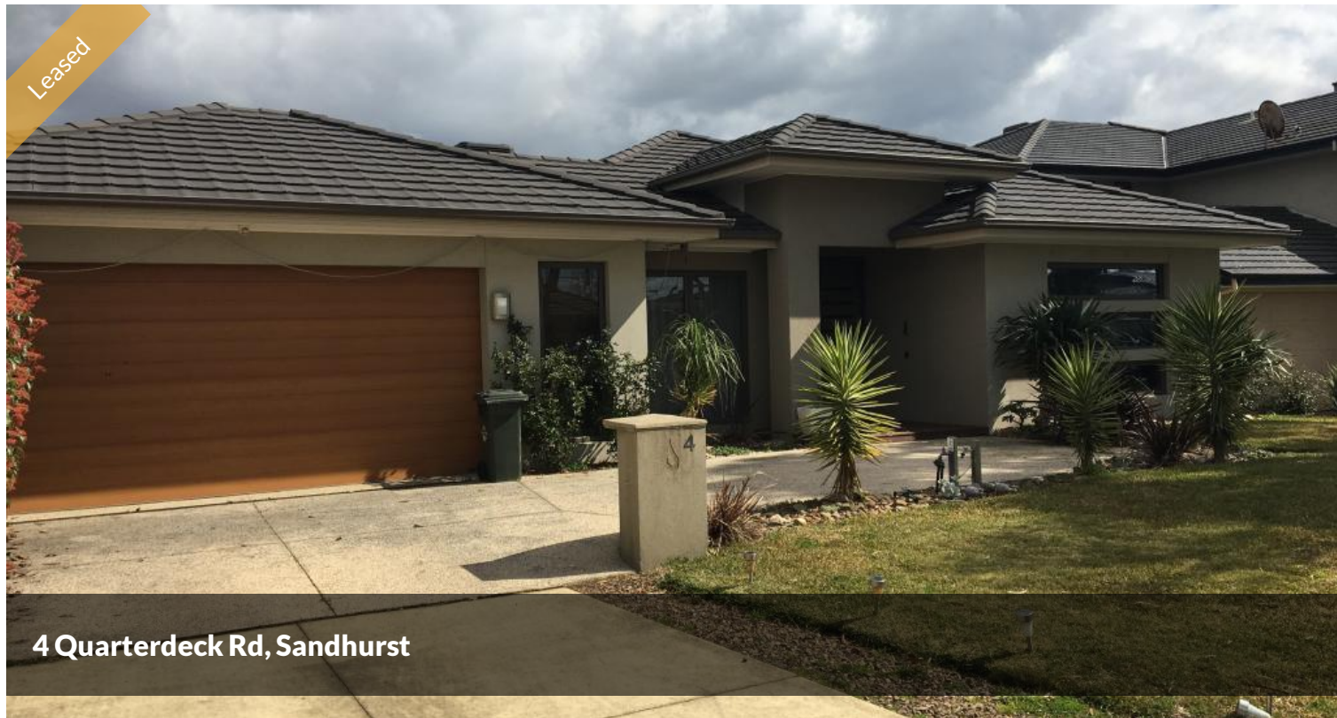
4 Quarterdeck Rd, Sandhurst