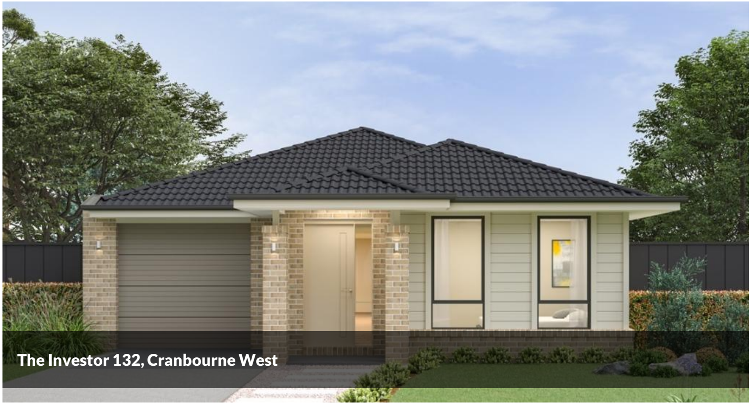
The Investor 132, Cranbourne West