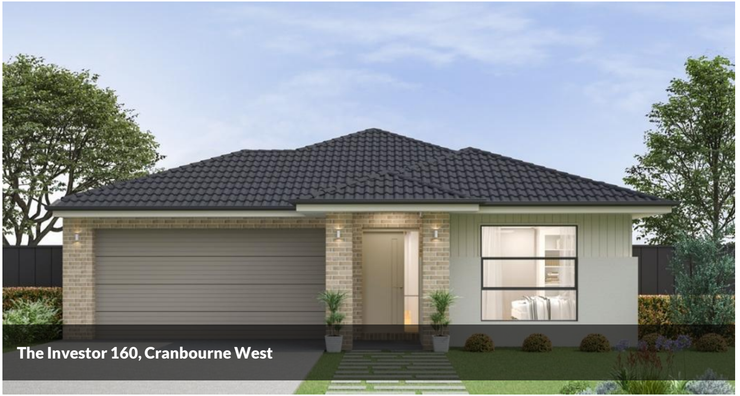
The Investor 160, Cranbourne West