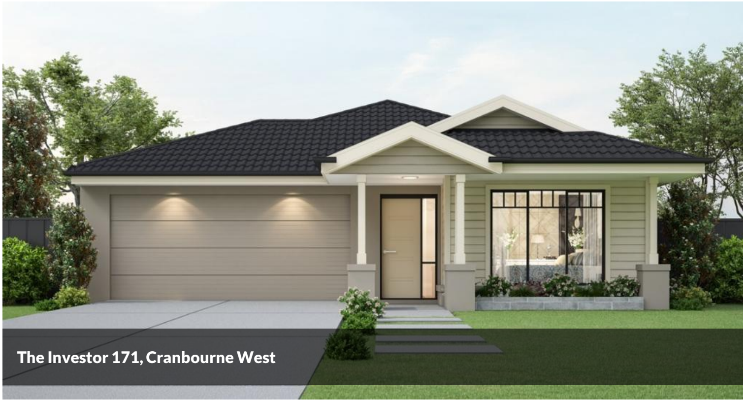
The Investor 171, Cranbourne West