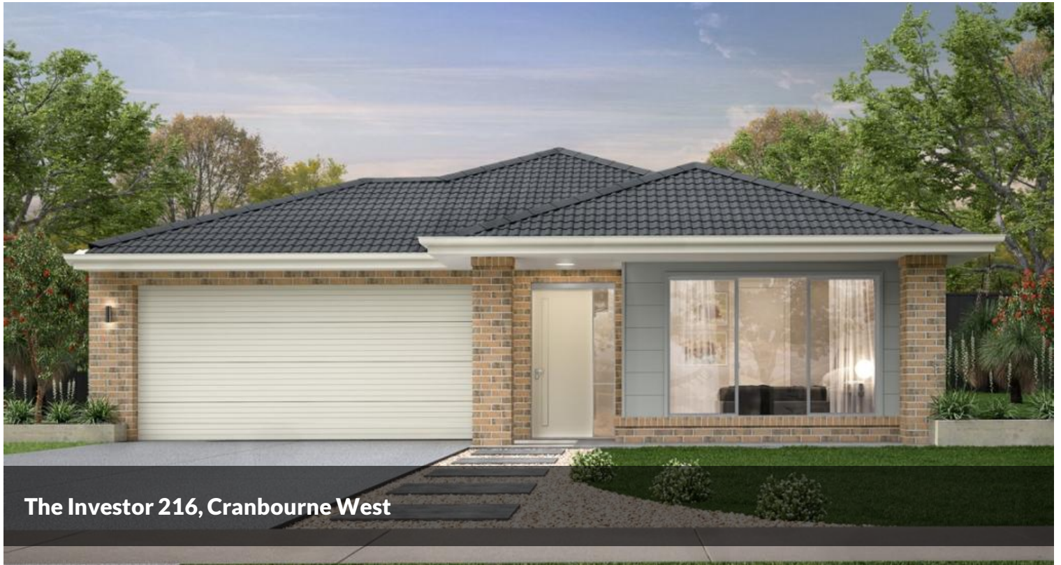
The Investor 216, Cranbourne West