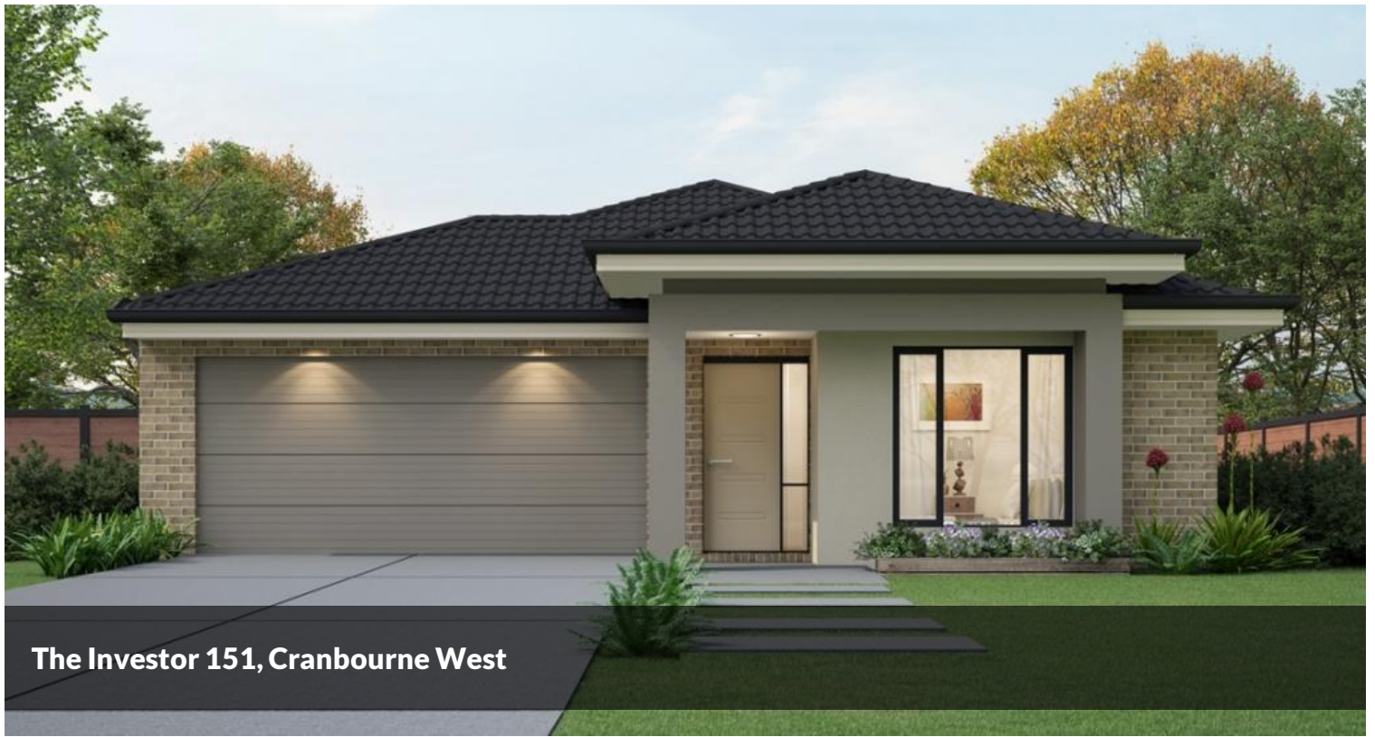
The Investor 151, Cranbourne West