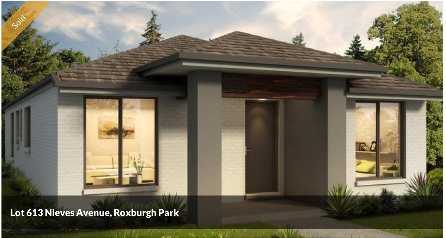
Lot 613 Nieves Avenue, Roxburgh Park