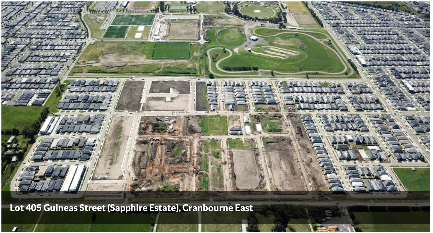
Lot 405 Guineas Street (Sapphire Estate), Cranbourne East