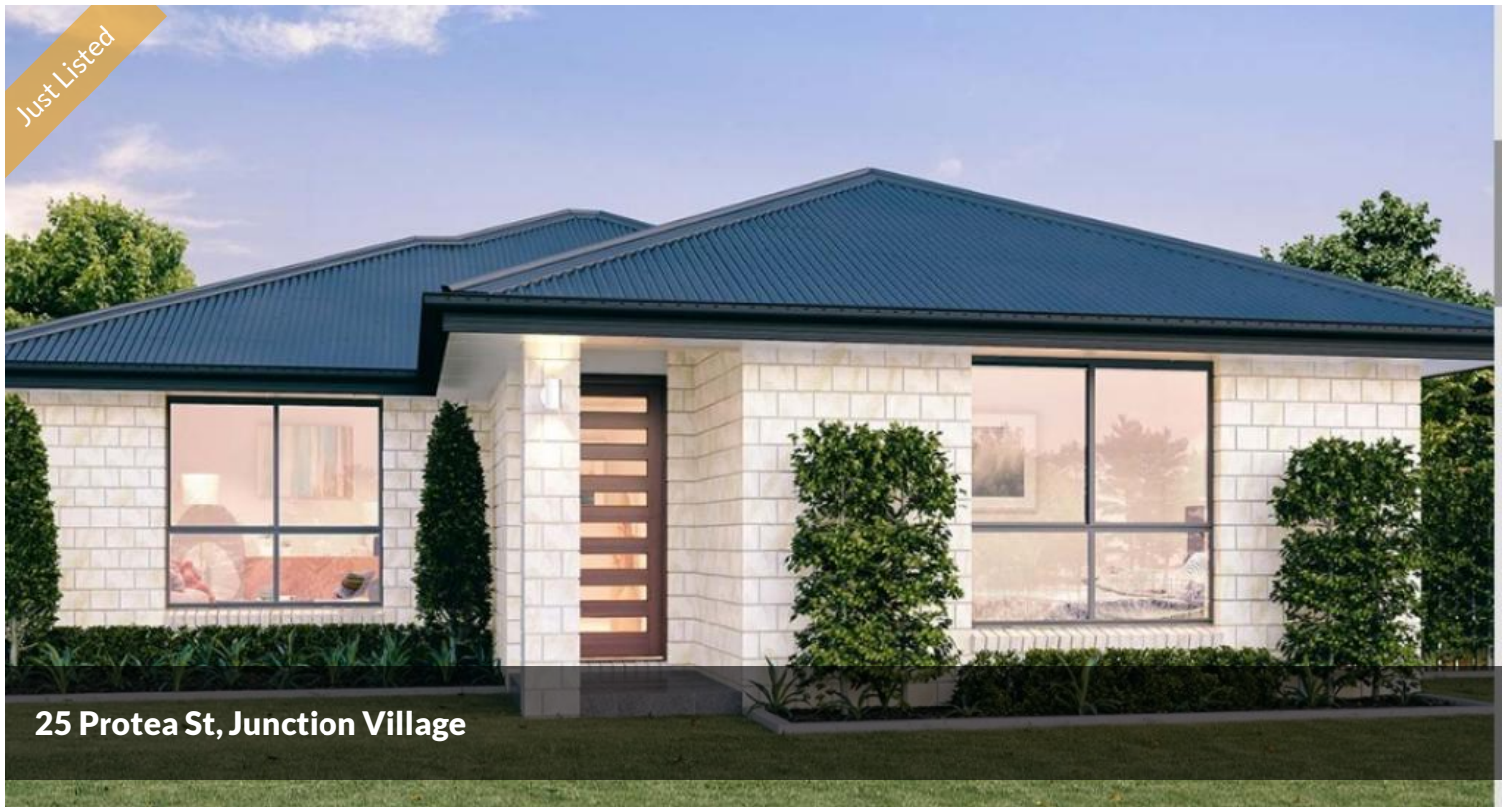
25 Protea St, Junction Village