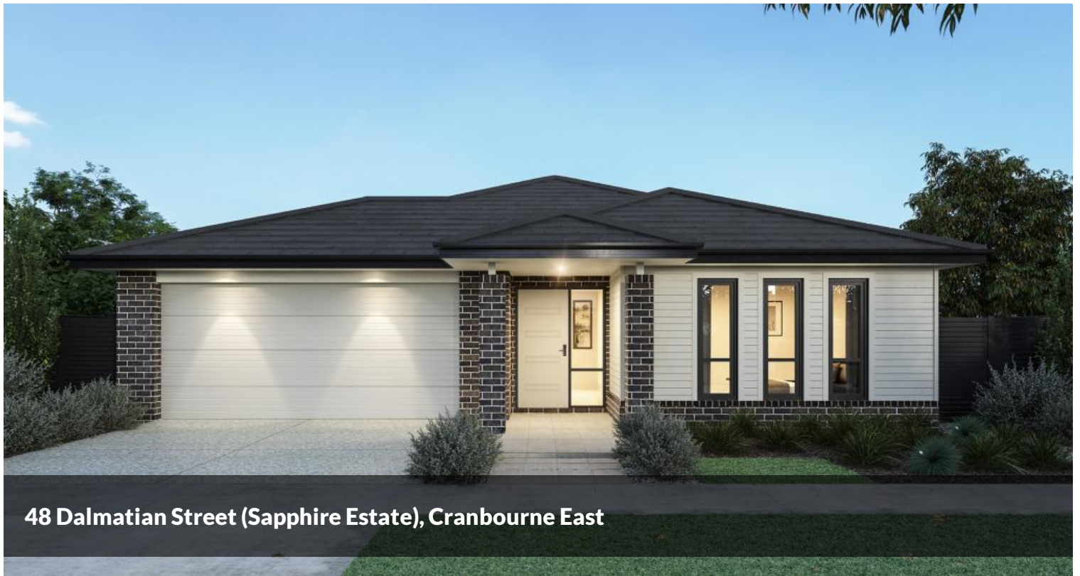
48 Dalmatian Street (Sapphire Estate), Cranbourne East