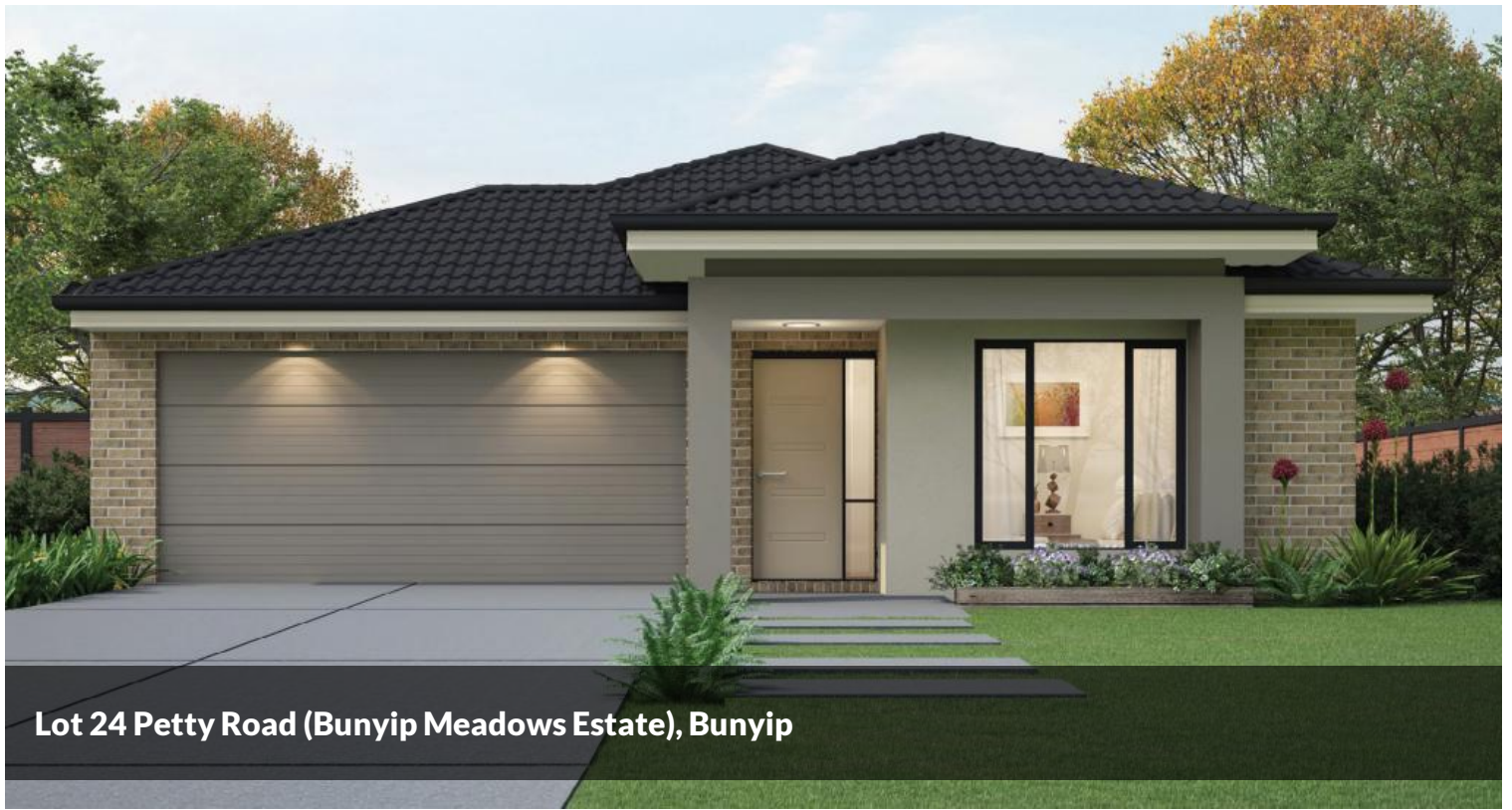
Lot 24 Petty Road (Bunyip Meadows Estate), Bunyip