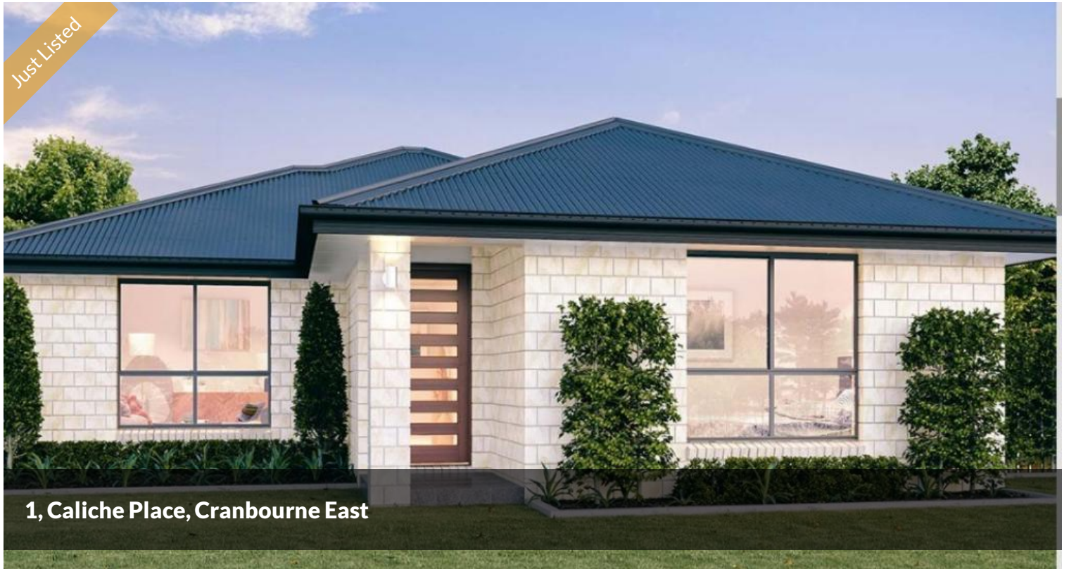
1, Caliche Place, Cranbourne East