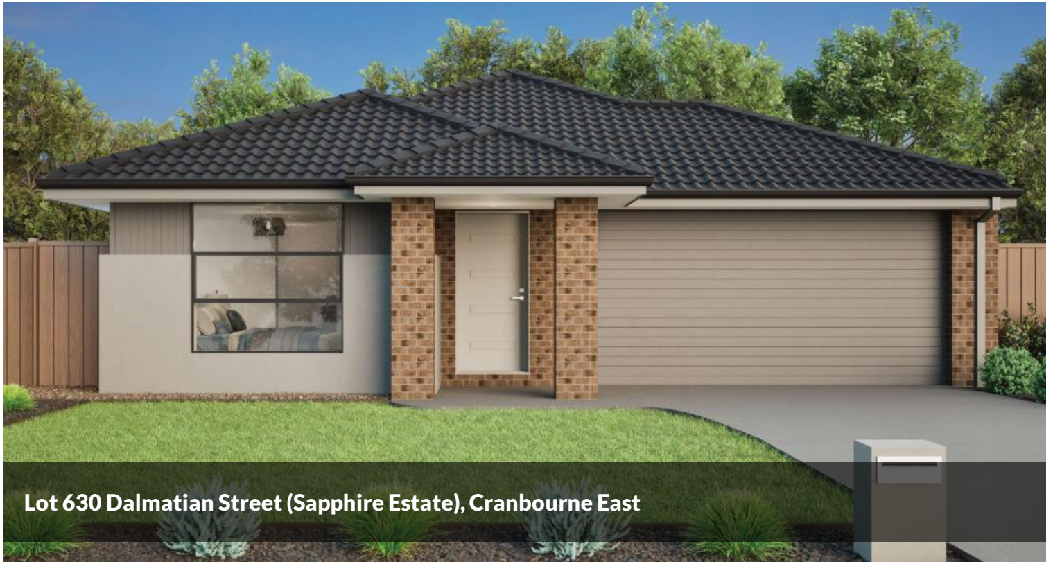
Lot 630 Dalmatian Street (Sapphire Estate), Cranbourne East