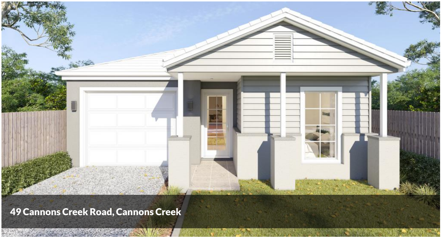
49 Cannons Creek Road, Cannons Creek