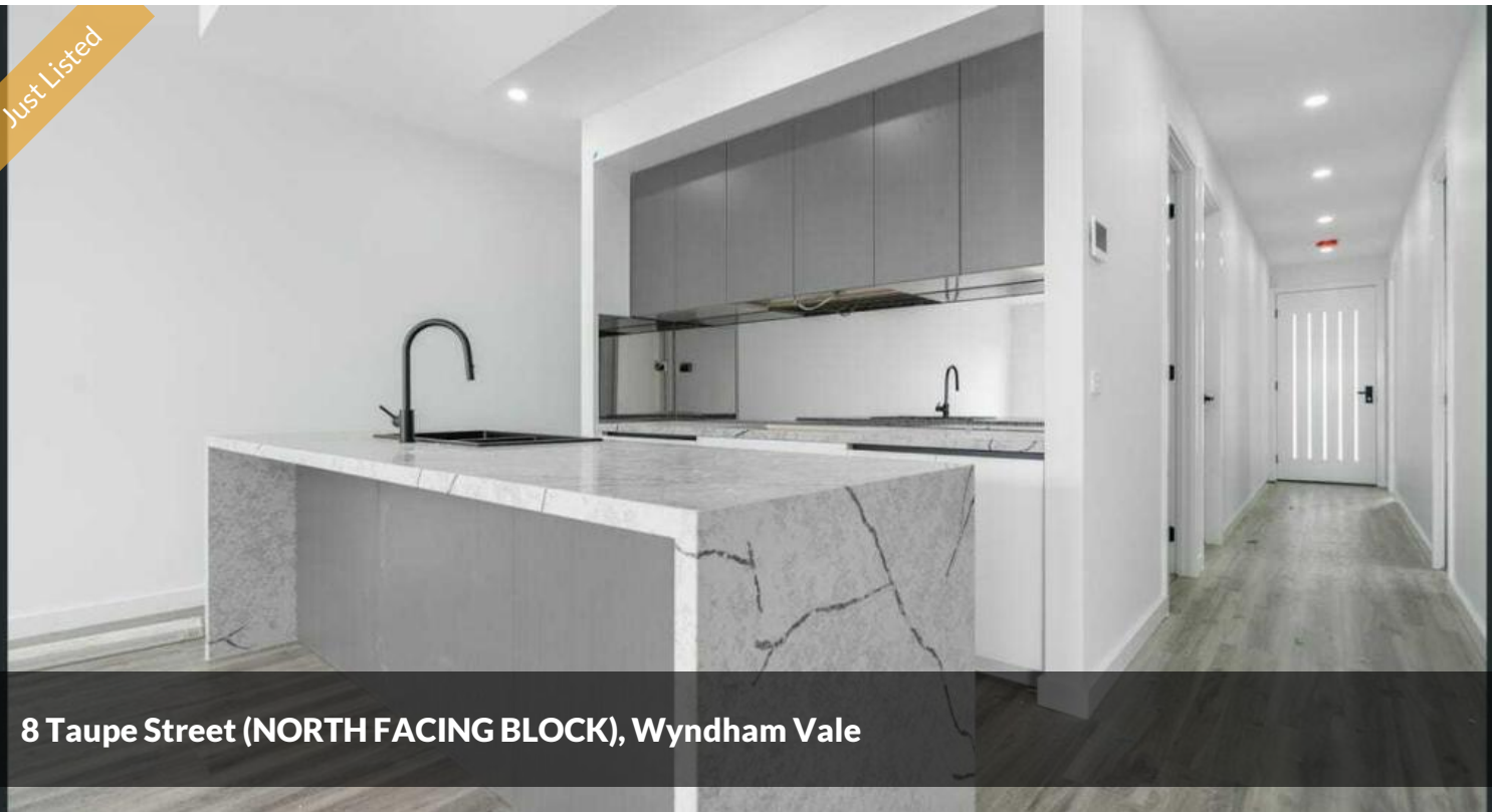
8 Taupe Street (NORTH FACING BLOCK), Wyndham Vale