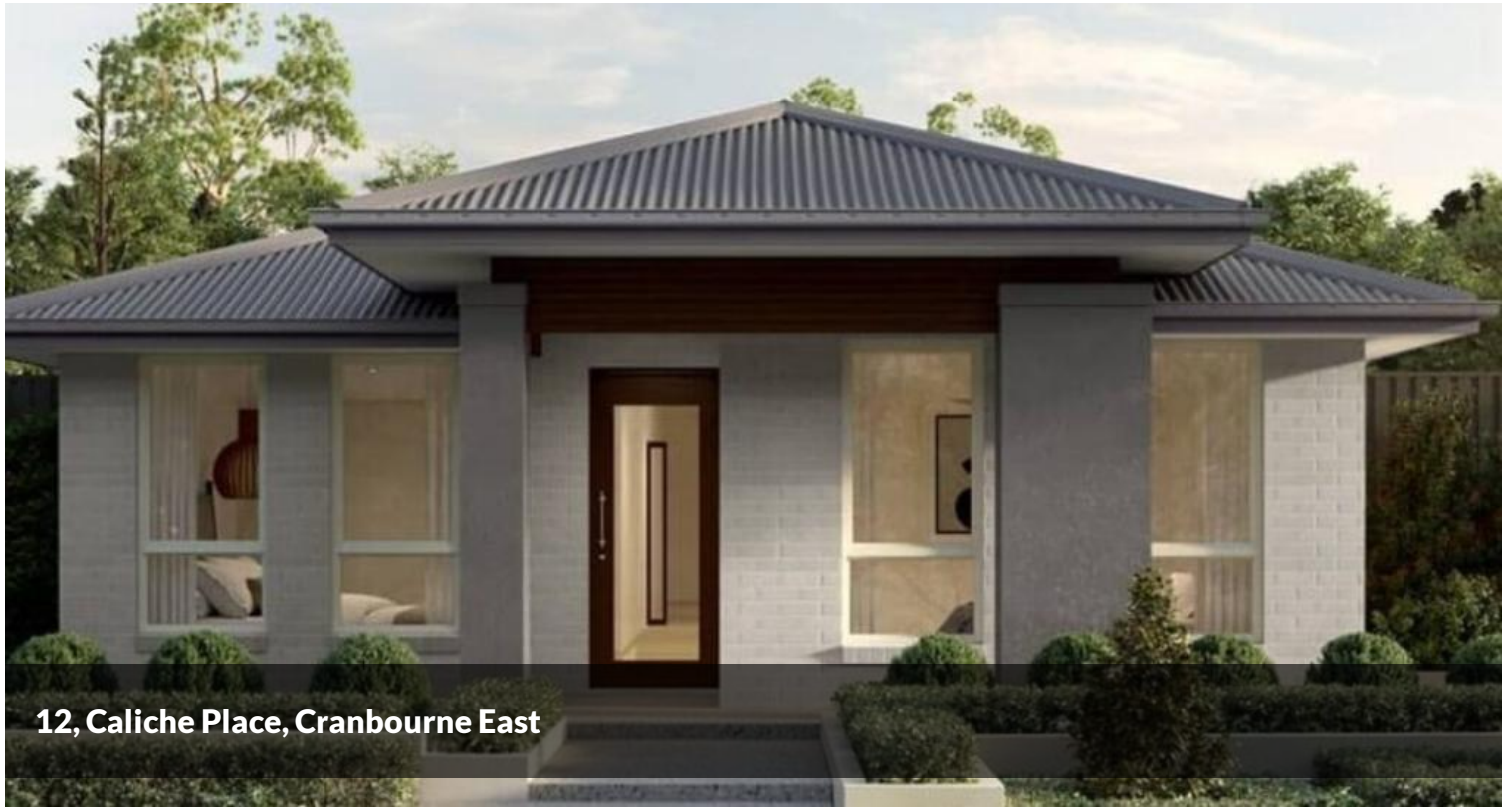
12, Caliche Place, Cranbourne East