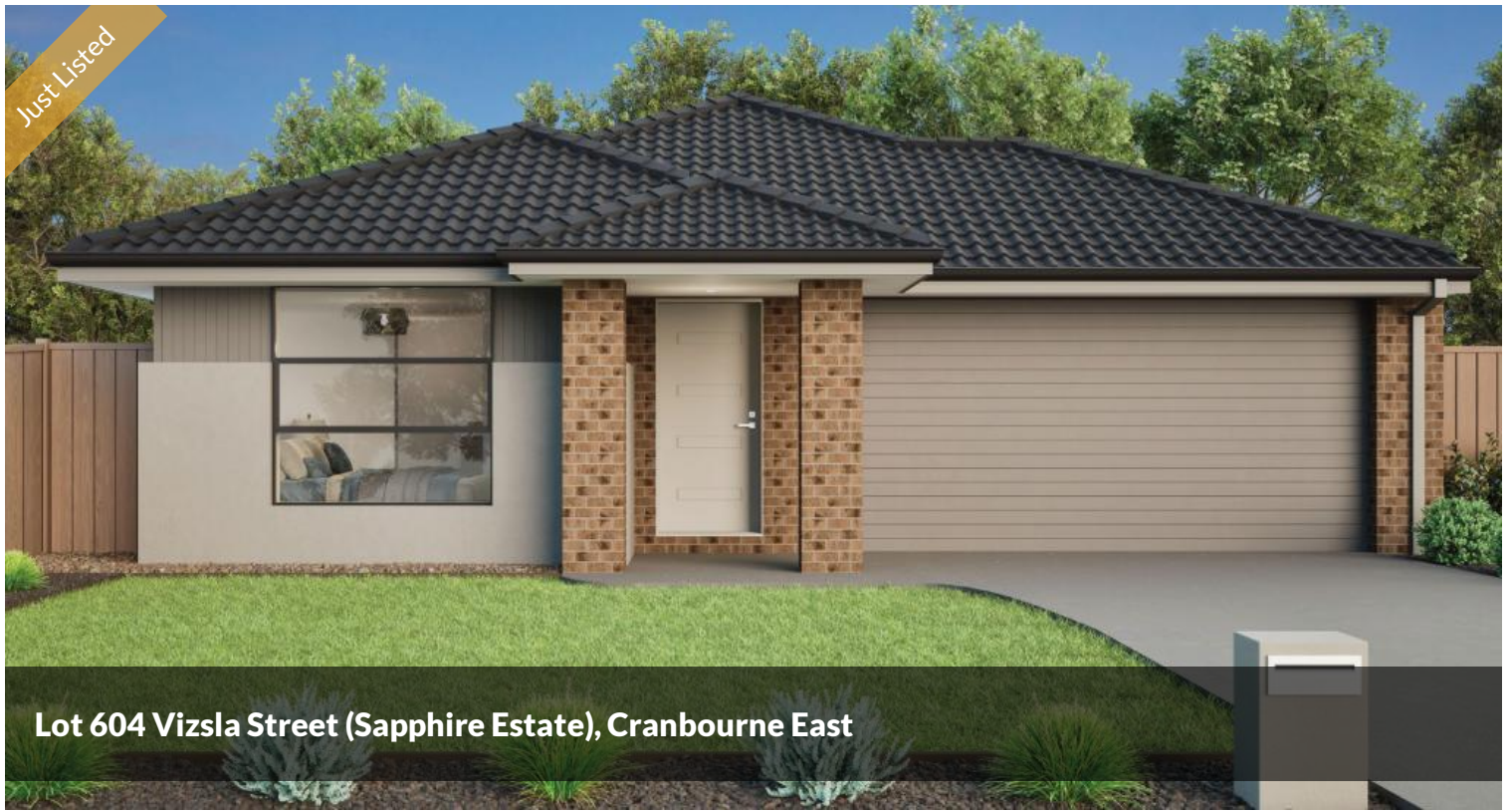
Lot 604 Vizsla Street (Sapphire Estate), Cranbourne East