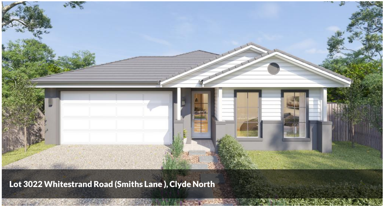
Lot 3022 Whitestrand Road (Smiths Lane ), Clyde North