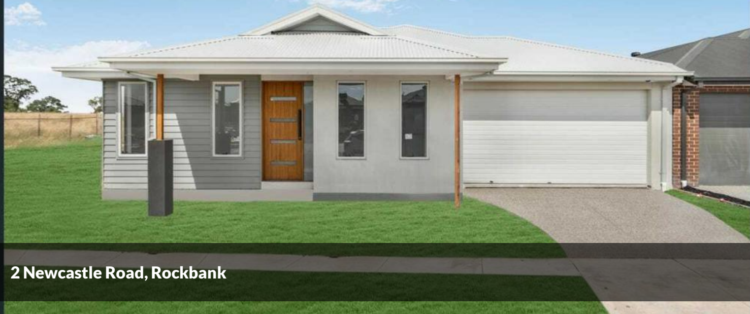
2 Newcastle Road, Rockbank