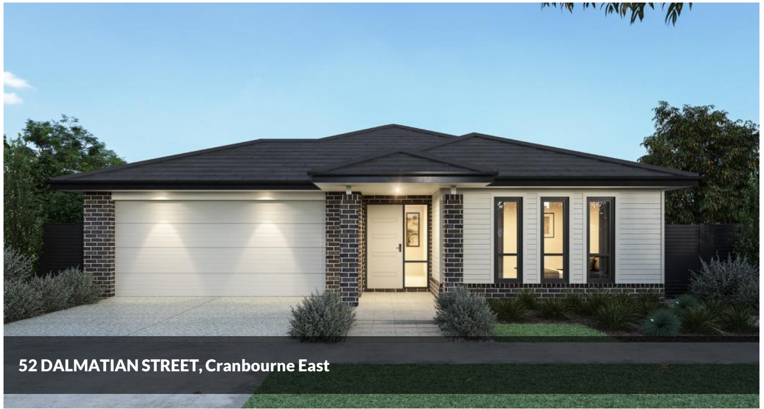
52 DALMATIAN STREET, Cranbourne East