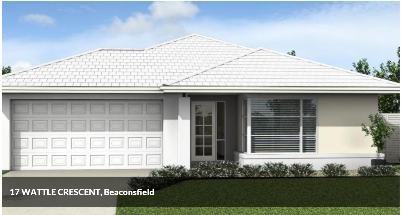
17 WATTLE CRESCENT, Beaconsfield