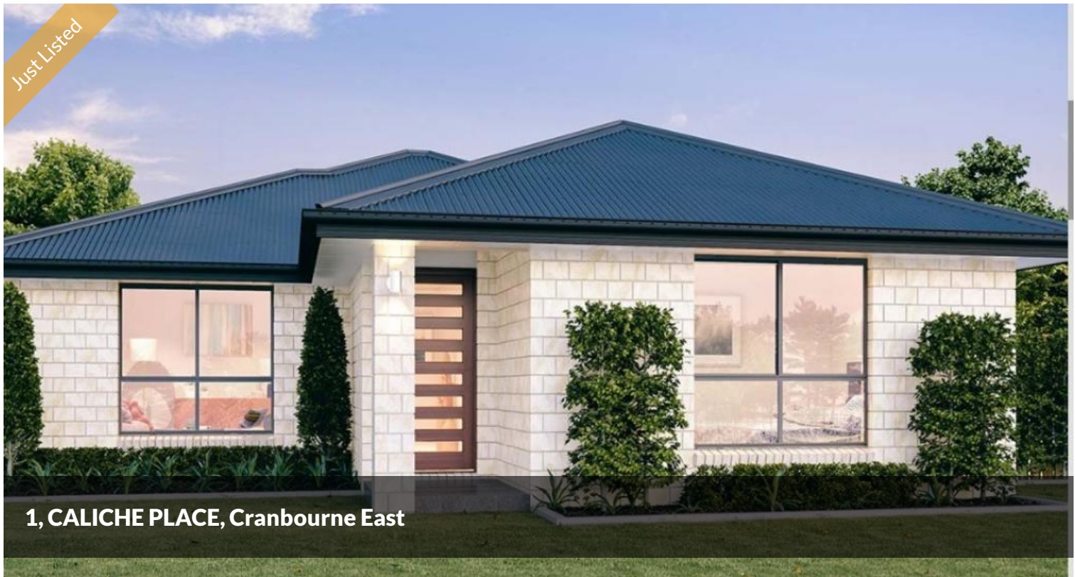
1, CALICHE PLACE, Cranbourne East