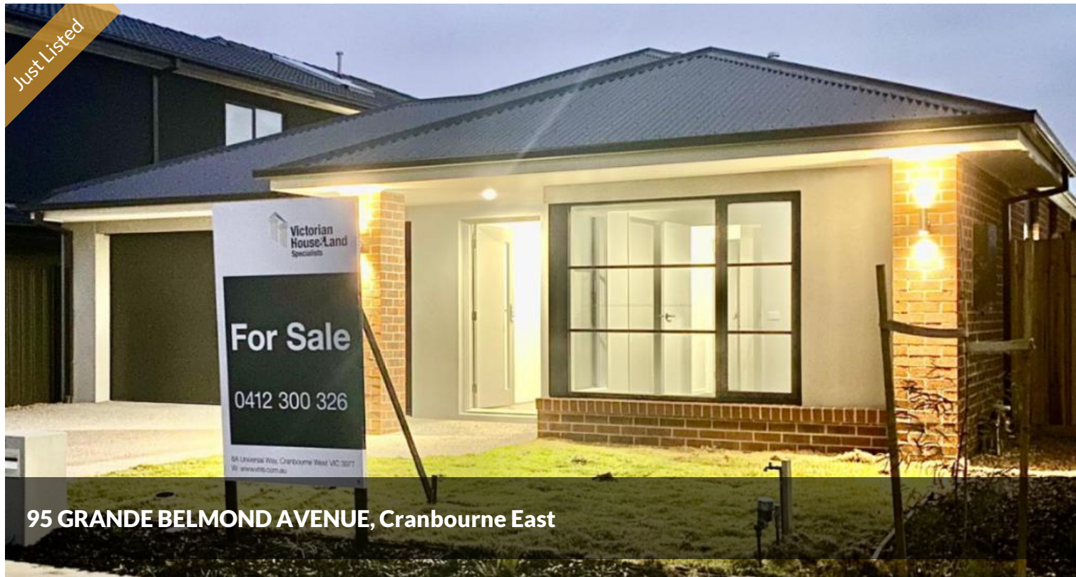
95 GRANDE BELMOND AVENUE, Cranbourne East