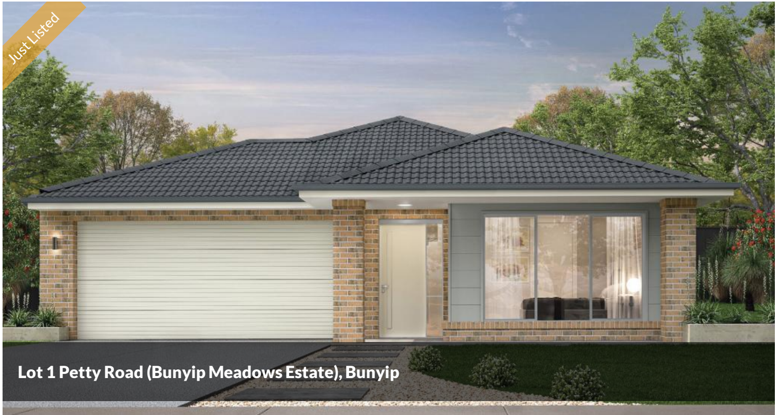
Lot 1 Petty Road (Bunyip Meadows Estate), Bunyip