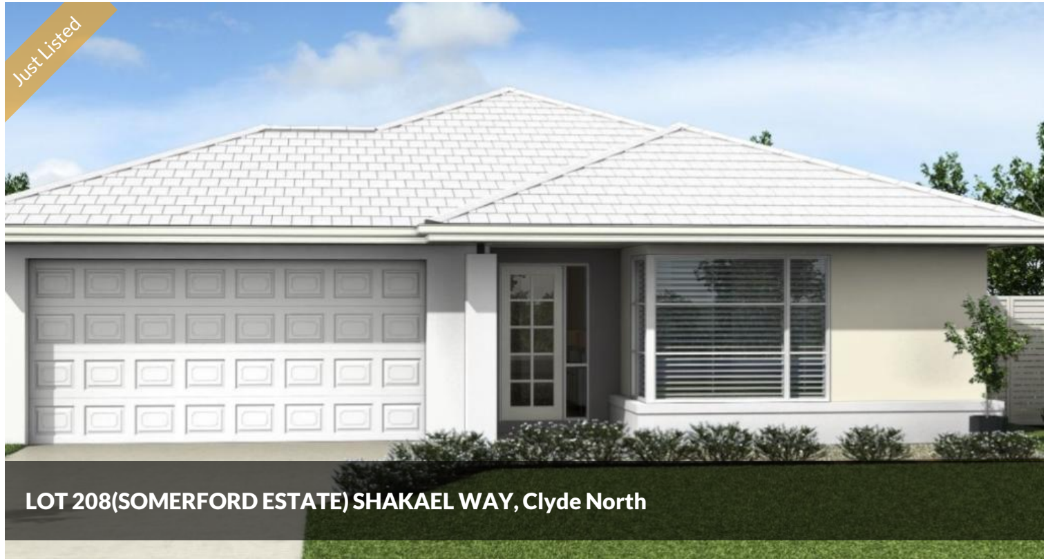
LOT 208(SOMERFORD ESTATE) SHAKAEL WAY, Clyde North