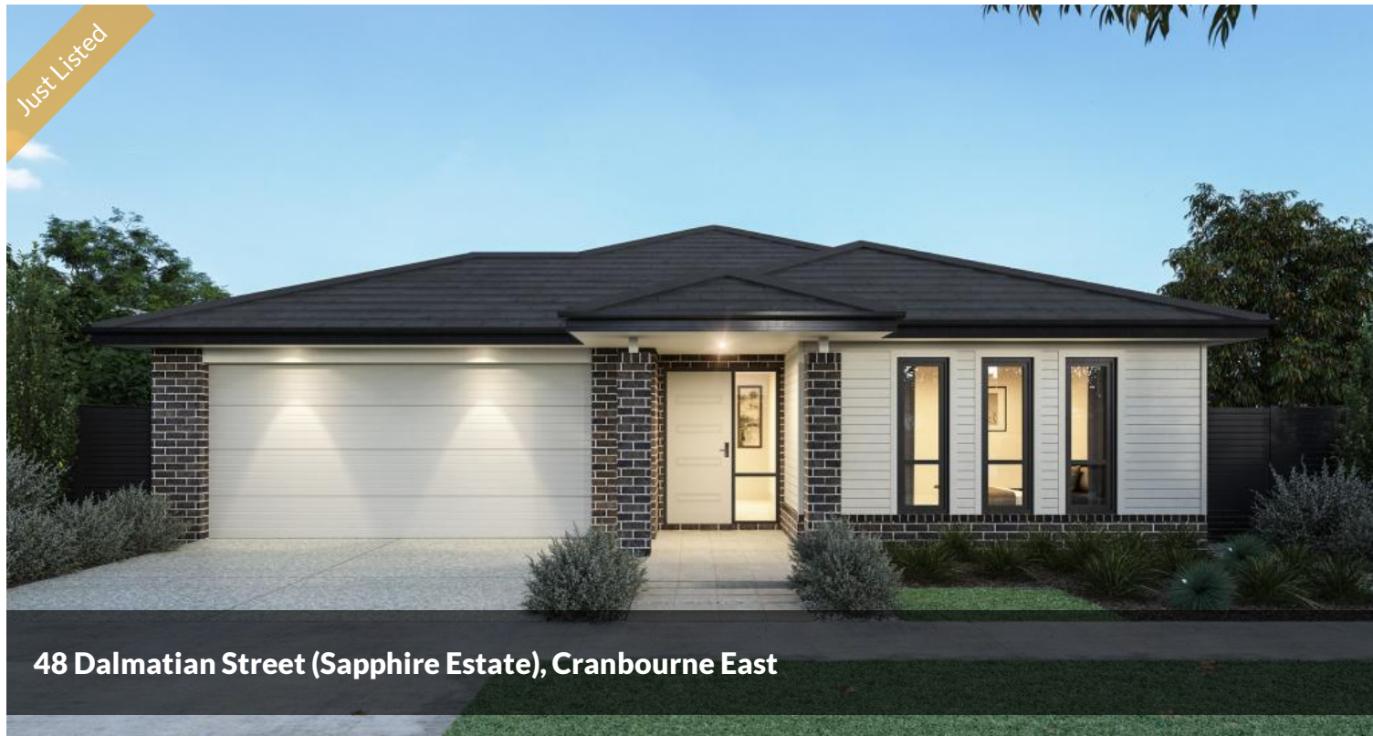
48 Dalmatian Street (Sapphire Estate), Cranbourne East